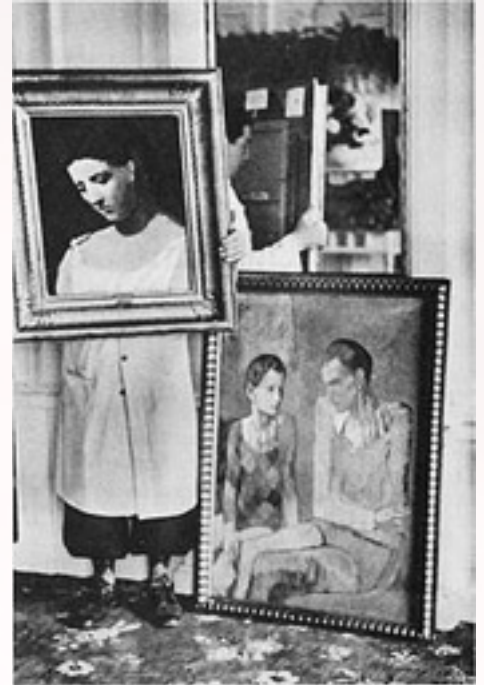
Scene from the Degenerate Art auction, spring 1938, works by Pablo Picasso, Head of a Woman and Two Harlequins. "Paintings from the degenerate art action will now be offered on the international art market. In so doing we hope at least to make some money from this garbage" wrote Joseph Goebbels in his diaries.

Works of art that were deemed worthy, were either given to high ranking Third Reich officers to keep in their personal collections or were stored to be placed in the Führermuseum once it was built. Hitler hid his plunder all over Nazi-occupied Europe, including the homes of several high-ranking officials, much of the art was stored in a few key locations. As the Allied Forces gained the advantage in the war and bombed Germany's cities and historic institutions, Germany "began storing the artworks in salt mines and caves for protection from Allied bombing raids. These mines and caves offered the appropriate humidity and temperature conditions for artworks." Three of the most well known repositories were Merkers, Altaussee and Siegen .