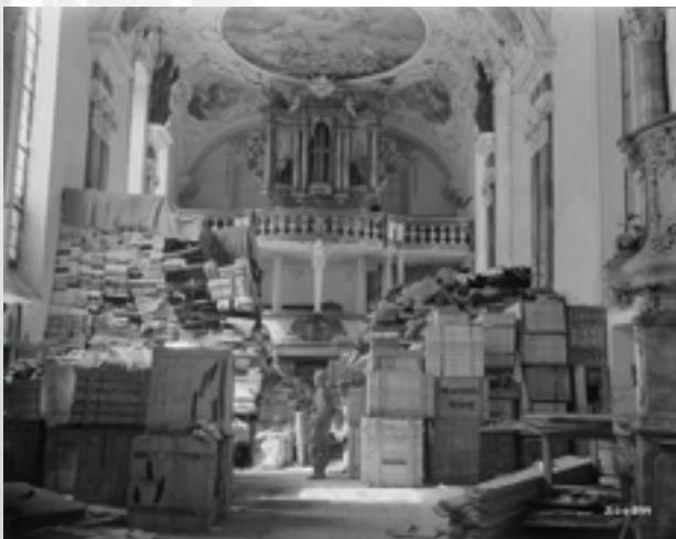
cache of art at Neuschwanstein Castle