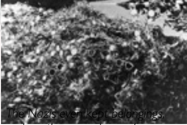
The Nazis even kept belongings, such as these eyeglasses, from those who were at concentrations camps.

During World War II, the Nazis stole any and every thing of value as they advanced across Europe. Obviously gold and silver currency were taken but the Nazis also stole cultural items of great significance, including paintings, sculptures, books, and religious treasures. The items stolen by the Nazis are referred to today as Nazi plunder . Plundering occurred from 1933 until the end of World War II.