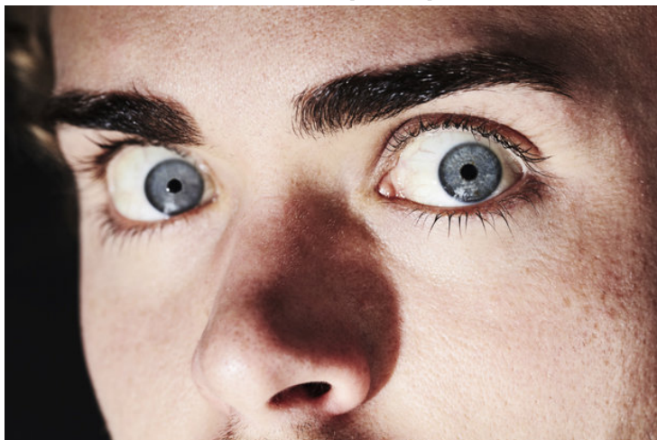
ADDICTIVE: This whole solar eclipse thing is really moreish...

or you might turn into a lunatic and you should take a bath before AND after a solar eclipse to wash away evil spirits.