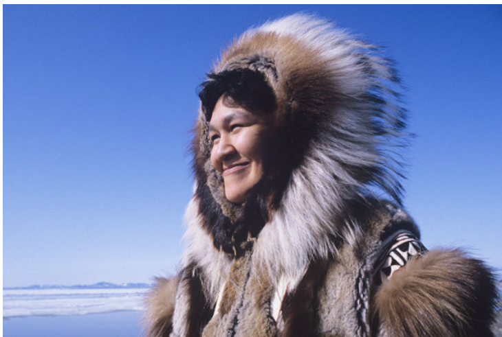
ESKI-NO: Disease strikes the Eskimo people whenever they forget to place their utensils upside-down during an eclipse. [GETTY]

Is it possible that more paranormal activity occurs in times of severe weather or solar activity? There is belief among the paranormal community that it's not only possible but it is more probable.