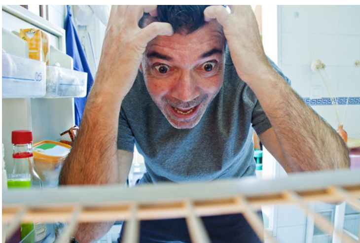
HUNGRY: Don't eat during an eclipse...just don't

This comes from a belief that any food cooked while the eclipse takes place, will be poisonous and impure.