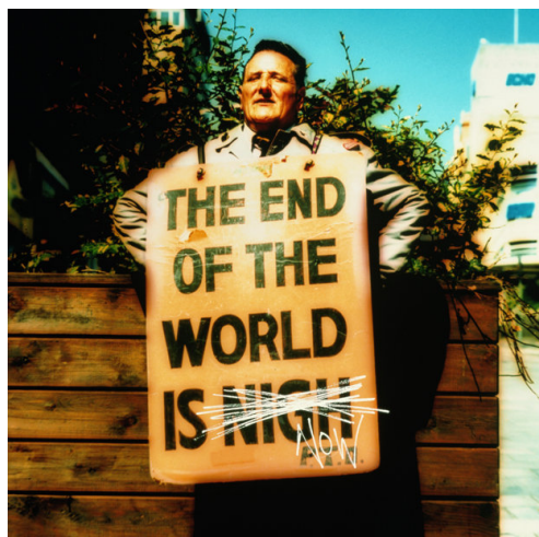
THE END IS NOW: Thai people think an eclipse is the first sign of the end of the world

spirit was to blame for the disappearance of the sun – so people would bang pots and set off fireworks to scare the spirit away.