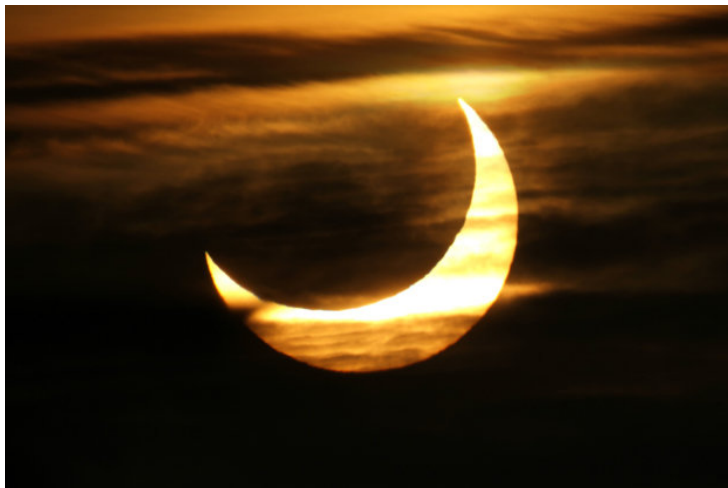
RARE: Most people are lucky to witness a total solar eclipse during their lifetime [GETTY]